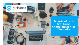
Secrets of tech-first